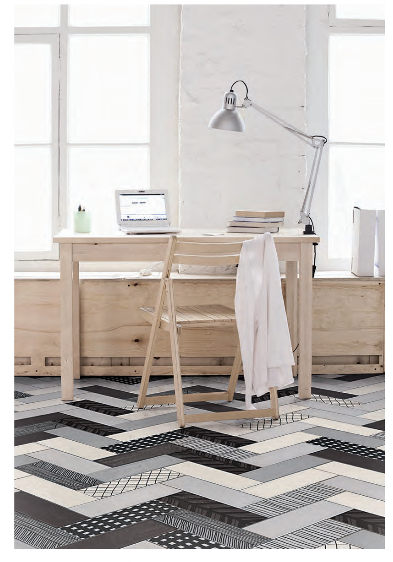
Variation is an inherent property of tiles and stone. Sizes are nominal and may include a joint.