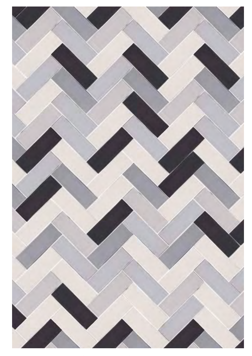
Variation is an inherent property of tiles and stone. Sizes are nominal and may include a joint.