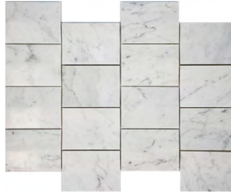
Carrara C Honed