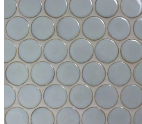
ANTIQUÉ MINT GLOSS