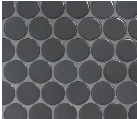
ANTIQUÉ CHARCOAL GLOSS