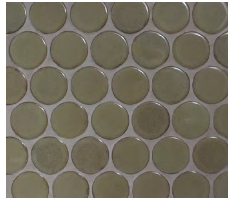
ANTIQUÉ OLIVE GLOSS