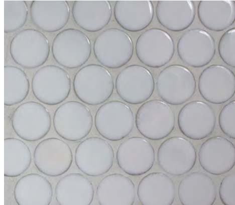
ANTIQUÉ WHITE GLOSS