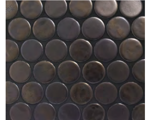
ANTIQUÉ BRONZE MATT